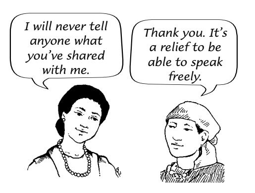
A midwife must keep what she knows about a woman private.

In particular, respect a woman's privacy about subjects that may be sensitive to her, such as sexually transmitted infections, miscarriages and abortions, and